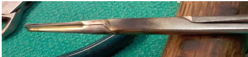
The old inserts are removed and replaced with the new inserts