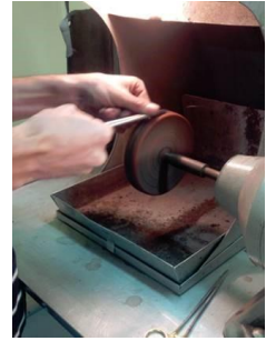
The insert is filed down to match the curvature of the needle holder tip