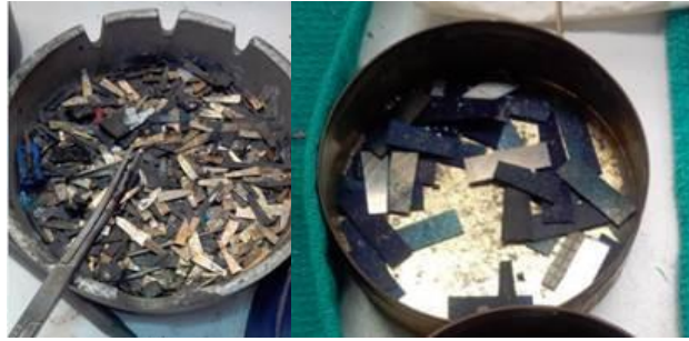
The tip of the needle holder is heated to a high temperature